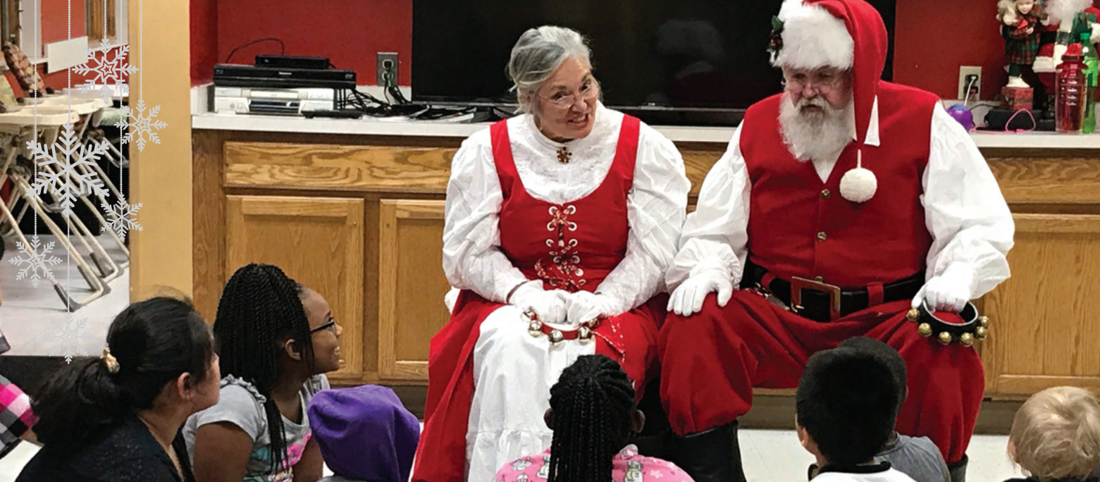
Each year we invite Santa to a party with our shelter residents. Santa reads stories, sings carols, and gives gifts to the children during his visit.