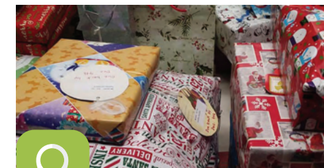
Generous community members and businesses "adopt" our clients to fulfill their holiday wishes and needs. Details inside.